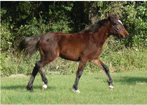
Black Dog's Annie Get Your Gun (Annie):

14.1 hand dun approved Connemara mare with wonderful old bloodlines. She is by Big Bear's Special Order and out of Molly Brown (Bobby Brown). Movement that is incredible, wonderful personality. Hunts, hunter paces, some dressage. Loves to trail ride and is great as a leadline pony. I have too many ponies. Ocoee is also a great broodmare and is approved ACPS. Competes barefoot, going strong at 15 years, very sound and easy keeping pony. $5,000