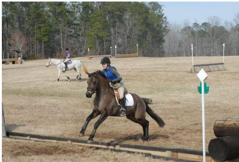
Cappy schooling the Novice ditch at Poplar Place.