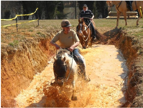
" Grits leading through the mud "