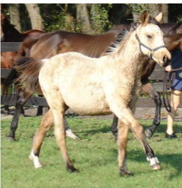
Black Dog's Top of the Morning (Mia):

Toby is a wonderful 3 year old Connemara gelding. Toby was born bay, going grey, will stay pony (14.1 to 14.2). He loads, clips, ties and bathes very well. Toby is well socialized with other horses and while playful, he is a very friendly pony. Toby has a nice trot with an excellent canter. His parents are Swift Ocoee River x Seven Hill's Grey Ghost and Toby has a full brother (Nicholas Mosse) who is a young stallion in Arizona. Video and photos available. Well handled, wolf teeth removed, all shots and worming performed on schedule. Toby will excel in any discipline, but we feel that his bold attitude will be well suited for eventing or hunting. $3,500.