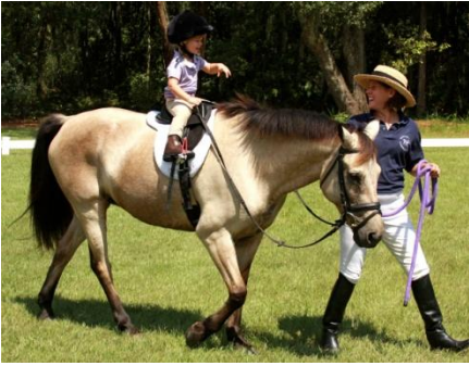
Swift Ocoee River:

sweet, playful, with incredible movement. Very balanced could show hunters or dressage. Star, 2 small whites. Video and photos available. $3,500.