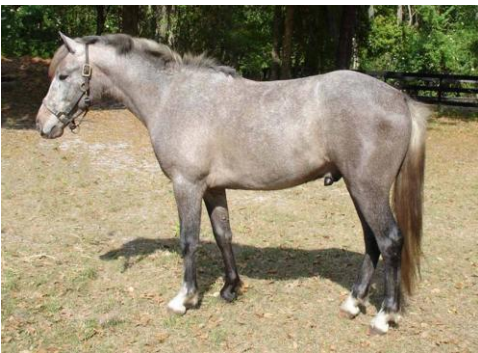
Black Dog's River Ghost (Toby):

----- Beth Davidson, Black Dog Farm, Plant City, FL