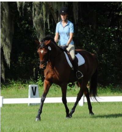
Black Dog's Flute:

This purebred Connemara yearling will stay pony sized and remain bay! Lovely small star and 2 small whites. Dam is Loughin's Leighseach (Lucy), who is an incredible pony, with warmblood movement in a pony package. WH Top Gun added a bit of size (Lucy is 13.3) and length of neck, and Annie is blessed with three very correct gaits and lovely uphill conformation. Annie is a bold, friendly pony. Will finish large pony. $3,500.