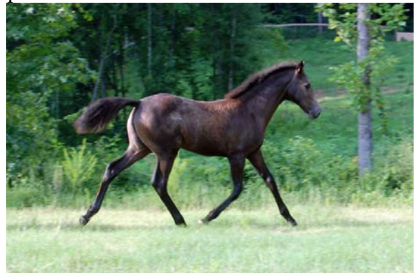
Brambleridge Celtic Sparrow