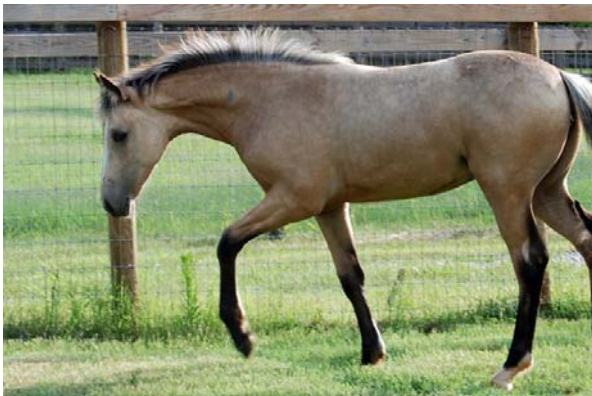
Brambleridge March Mayhem

Our purebred filly, Brambleridge March Mayhem, made her trek to Ontario, and is safely settled in at her new farm, Muskoka Lakes Connemaras. She's already attended her first in-hand show, and her owner said she was better behaved than the older and more experienced ponies.