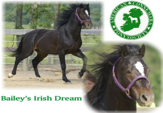
Bailey's Irish Dream

Please call: 423-235-7280 or 423-612-1741 to book your breeding for 2010.