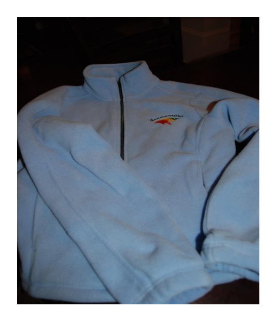
Fleece jacket with Region IV logo