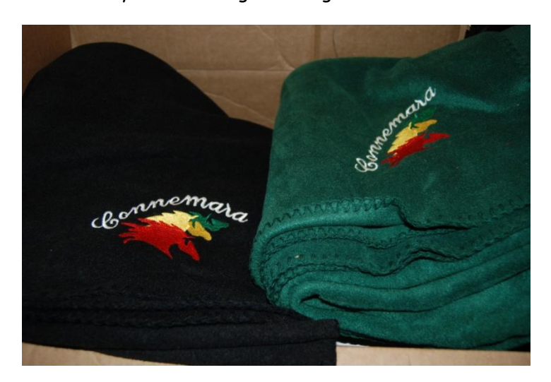
Fleece blankets with Region IV logo