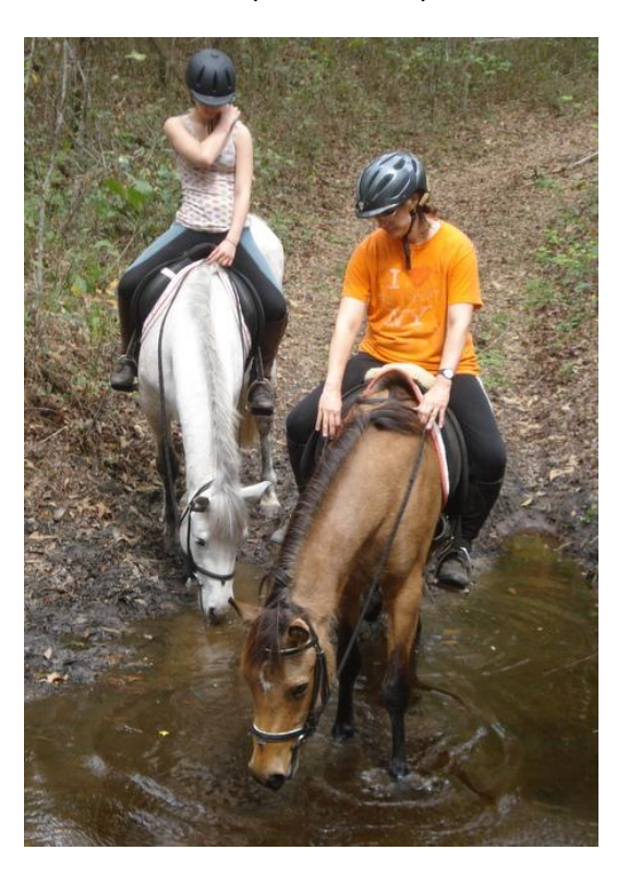
Balmullo's Dixie Chick (bay)