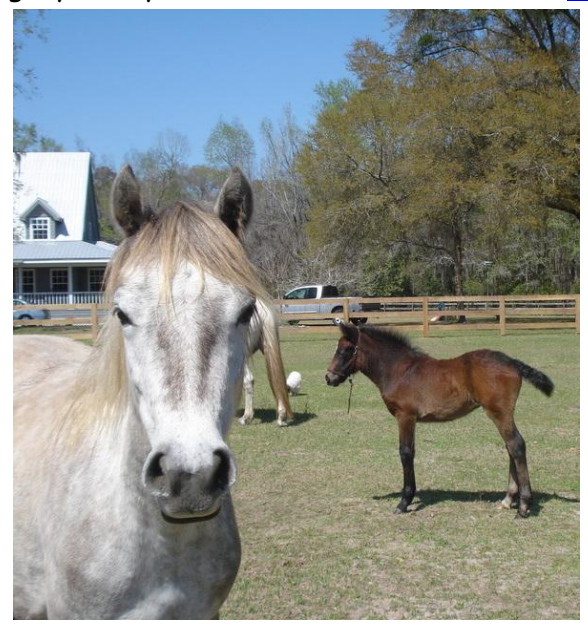
Balmullo's Jezebelle with little sister, Belladonna

For Lease: Foothill's Field Marshall, 2 \frac{1}{2} year-old colt, beautiful mover! All bay and pretty big. 386-462-3726 or <u>connemaras@windstream.net</u>