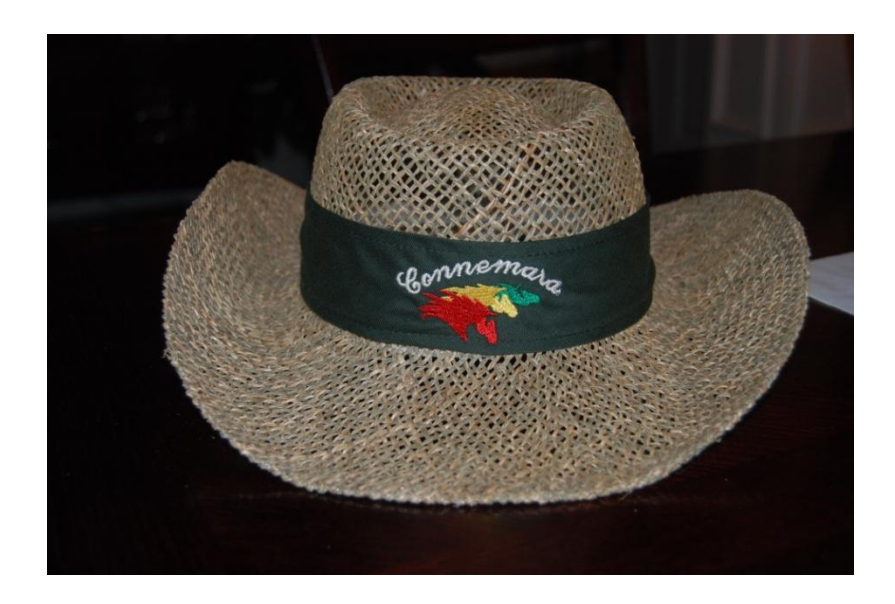
Straw hat with Region IV logo