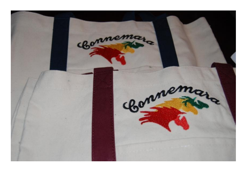
Canvas carry-alls with Region IV logo