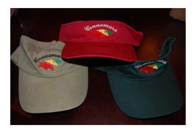
Baseball caps with Region IV logo